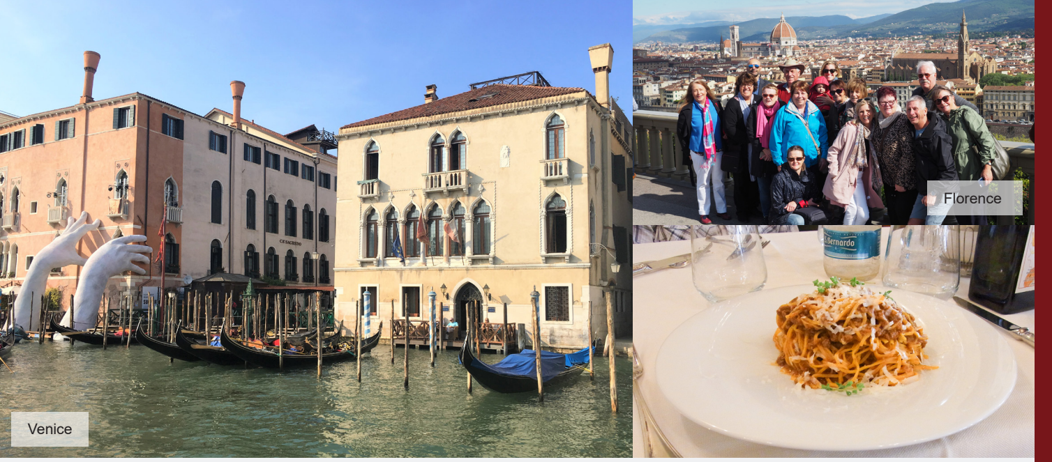
"For a first time traveller and one travelling on their own, I would heartily recommend your tours. The choice of destinations and comprehensive knowledge, are exactly what I was seeking." M O'Halloran (WA).