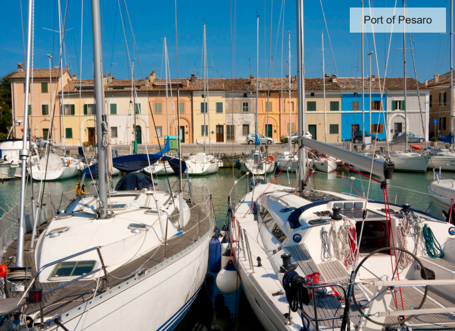
Port of Pesaro